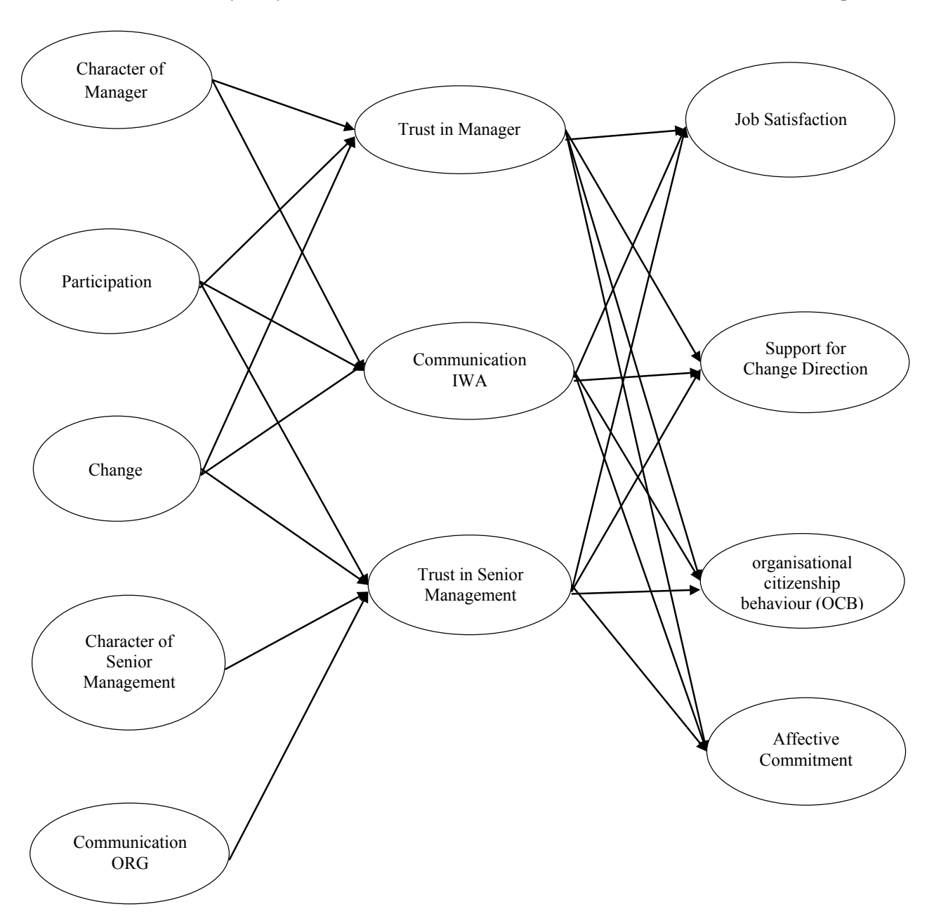
Figure 1. Initial Statistical Model in PLS (based on the Australian maximised model)

Once the discriminant validity has met the benchmarks, the next test considers the consistency of the questions within the variable using Cronbach's Alpha. The calculation of Cronbach's Alpha holds all of the paths from the questions to the variable as equal, although some questions may be stronger representatives of the variable than others. PLS accounts for this by giving each question a weighting that maximises the variance explained for the prediction of the variable. Therefore, a better measure of internal consistency in PLS is Composite Reliability which allows variable path weights. However, due to Cronbach's widespread use, and for comparability with other studies, both Cronbach's Alpha and