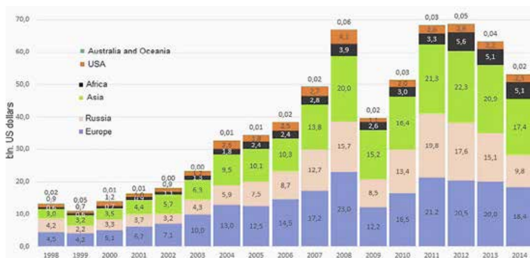
Fig 2. Export of goods from Ukraine (1998-2014)